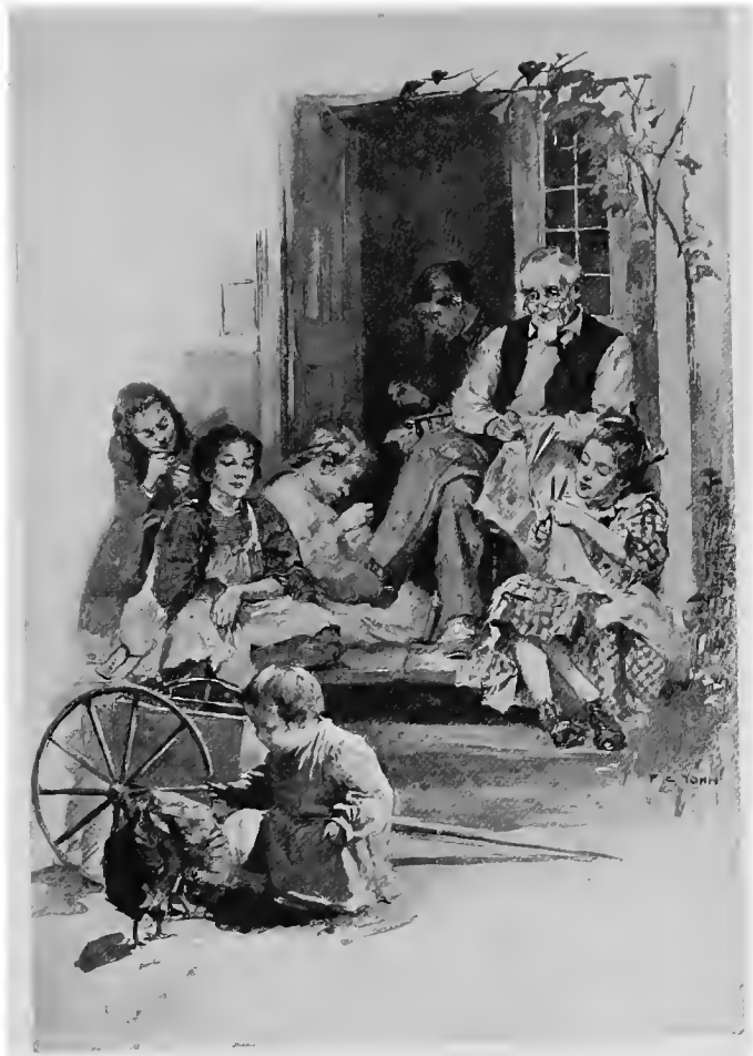
GREAT, THOUGH FRIENDLY, WAS THE RIVALRY BETWEEN THEM